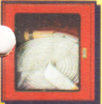
HOUSE REAL PIPE