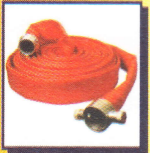
FIRE HOUSE PIPE