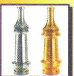
BRANCH PIPE NOZZLES